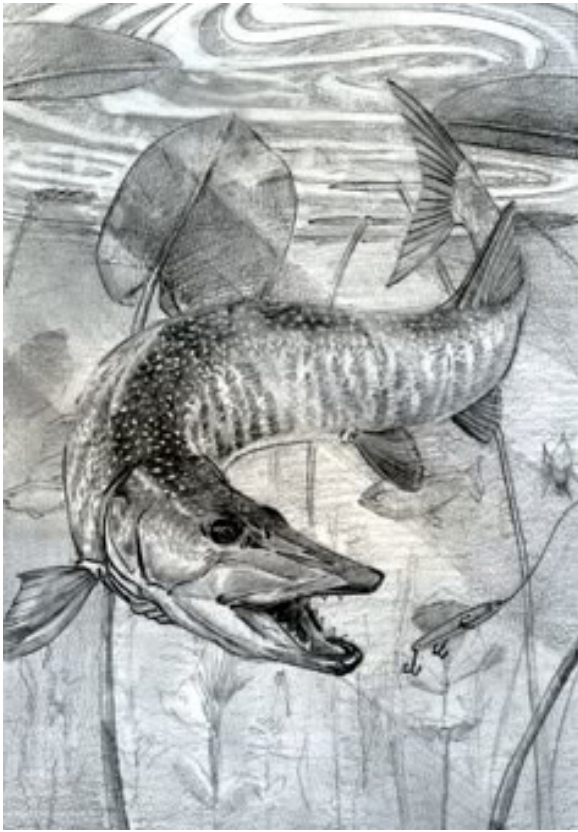
Original artwork drawn by gannonned Source: https://gannonned.wordpress.com/2015/02/24/musky-recent-commission/