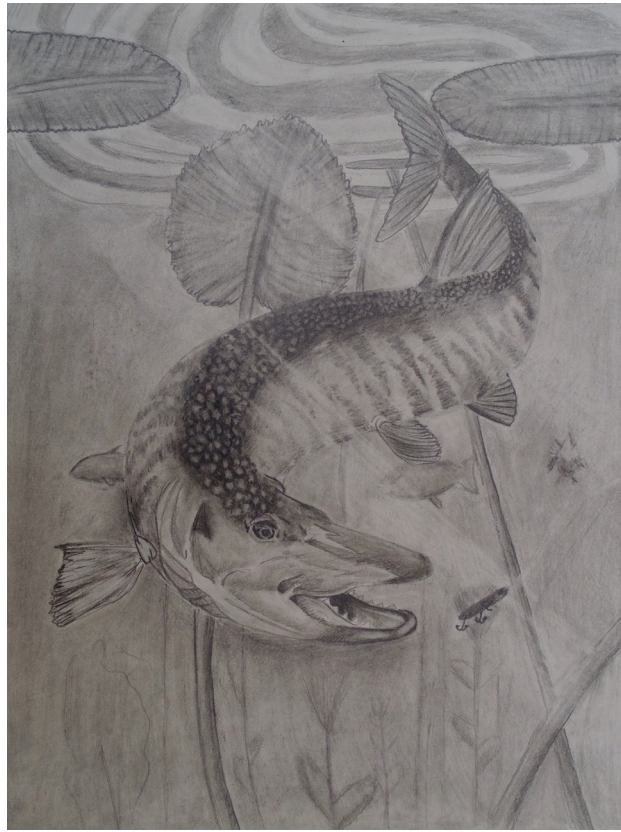
Replicated artwork submitted to the Fish Art Contest

This is an example that shows a case of plagiarism. Even though the student drew it by hand, they copied another artist's work nearly exactly—same medium, pose, lighting, and background. This level of replication is not allowed in the Fish or Songbird Art Contests. Even if you draw something yourself, copying another artwork or photograph too closely—especially in composition and execution—is considered plagiarism. Your artwork must be an original creation that reflects your interpretation and creativity.