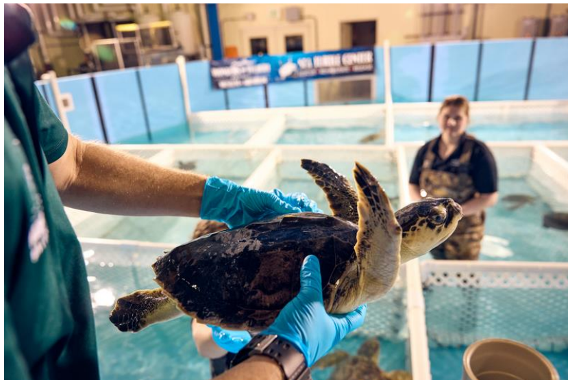
WOW team members place a Kemp’s ridley turtle within the center’s holding area

The latest group of 20 loggerhead and Kemp’s ridley sea turtles arrived in Springfield, Missouri, on Saturday, December 21, following a dramatic increase in sea turtle strandings along the northeastern U.S. coast due to rapidly dropping ocean temperatures. The turtles were transported from The New England Aquarium in Boston, Massachusetts, via a rescue flight coordinated by the nonprofit organization Turtles Fly Too. Upon arrival, WOW’s expert animal care team immediately began providing advanced medical care, giving these turtles a second chance at survival and, ultimately, a return to the wild.