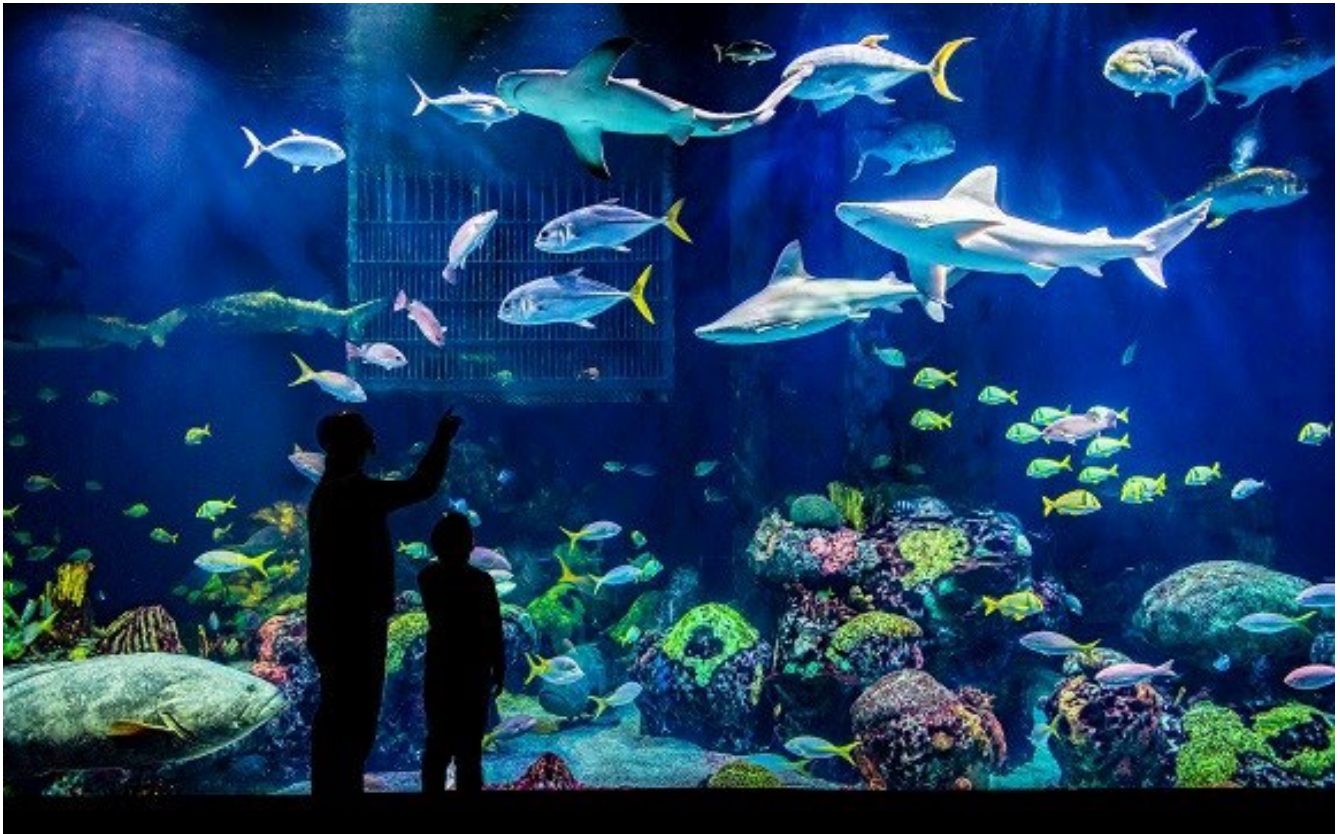
Guests can plunge to the depths of the ocean floor and admire dozens of reefs and live aquatic animals including diving with sharks

This poll ranks the top 20 prominent institutions across North America, highlighting the best of the best when it comes to attractions for conservation-minded guests of all ages. WOW was nominated for the competition by a panel of nationally respected travel experts as part of USA Today's annual Readers' Choice Awards. To determine a winner, members of the public across the United States were invited to cast their vote.