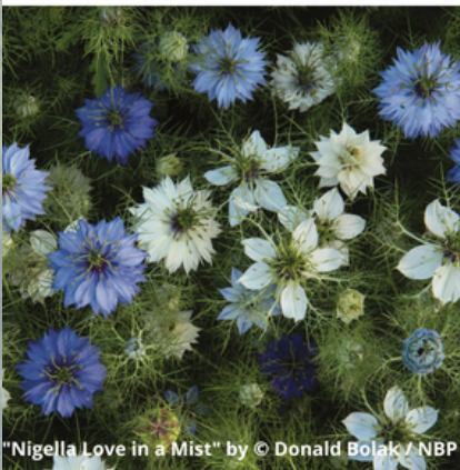
"Nigella Love in a Mist" by © Donald Bolak / NBP