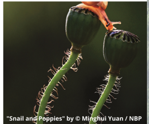
"Snail and Poppies" by © Minghui Yuan / NBP