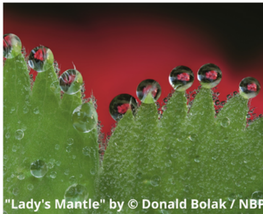
"Lady's Mantle" by © Donald Bolak / NBP